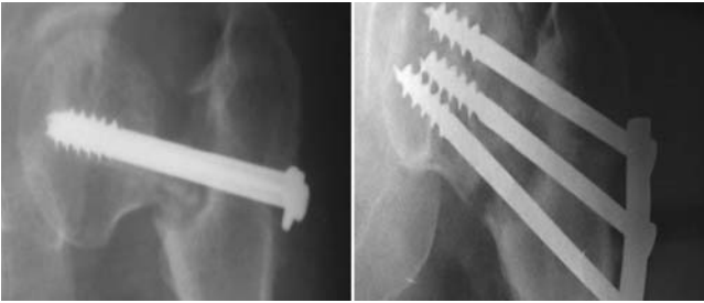
Figure-2A: Pre-Operative and post- operative X-rays.

30°-45° and temporarily stabilized with a K. wire crossing acetabulum. Reduction was rechecked with a C.arm. Once reduction was confirmed, drill holes were made (two through the plate and one or two outside the plate to 5mm from sub-chondral bone). Non-union was stabilized by compression with cancellous screws achieved by manually pressing the trochanter and opposite side of the pelvis. Plate was stabilized by three cortical screws through the femoral shaft. Quality of reduction/screws size and position was rechecked through a C arm and X-rays, minor adjustments made.