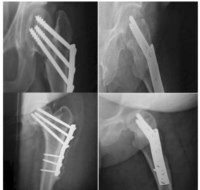
Figure-2B: Post-Operative X-rays at one and two year follow up showing healing. Periosteal new bone is seen over plate due to low grade infection which cleared after removal of implant. This patient required removal of bone from inferior part of neck on femoral head side.

The mean period for healing was 7.53± 2.3 months. There