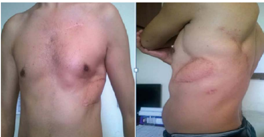
Figure-3: The patient 32 months after the second operation.

chondromatous proliferation and was examined by a pathologist specializing in bone. The ultimate diagnosis was a grade 1 chondrosarcoma. Our tumour oncology