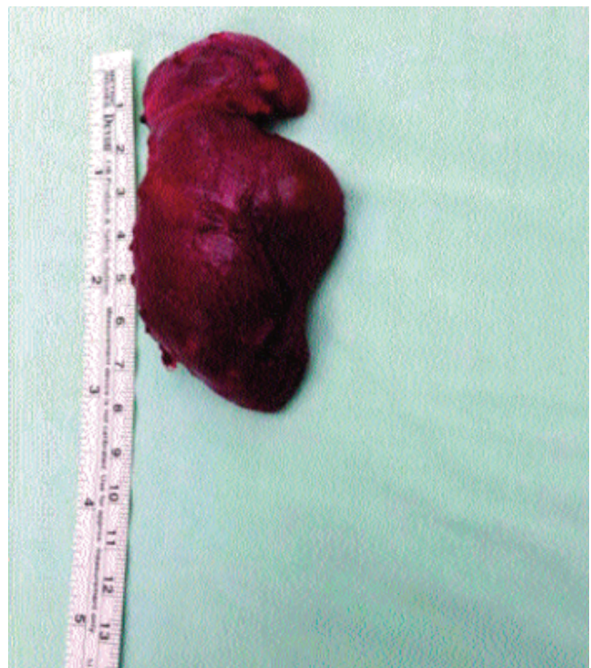
Figure-4: Final specimen post excision.