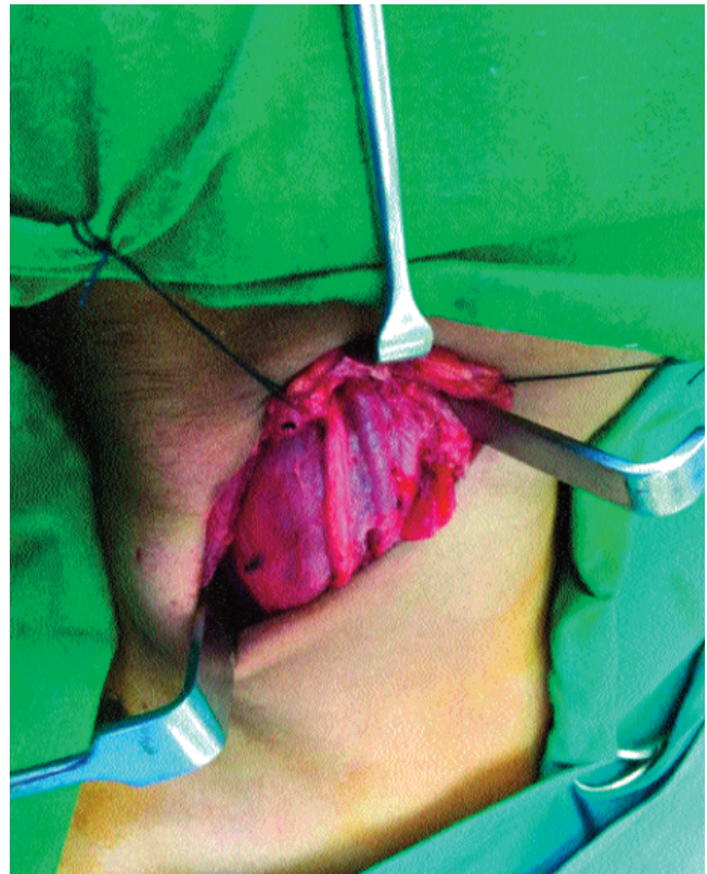
Figure-3: Intra-operative view of the lesion deep to the great vessels and nerve.

Post-operatively the patient remained stable. Neck drain was removed the following day and the patient discharged. Patient was assessed for cranial nerve