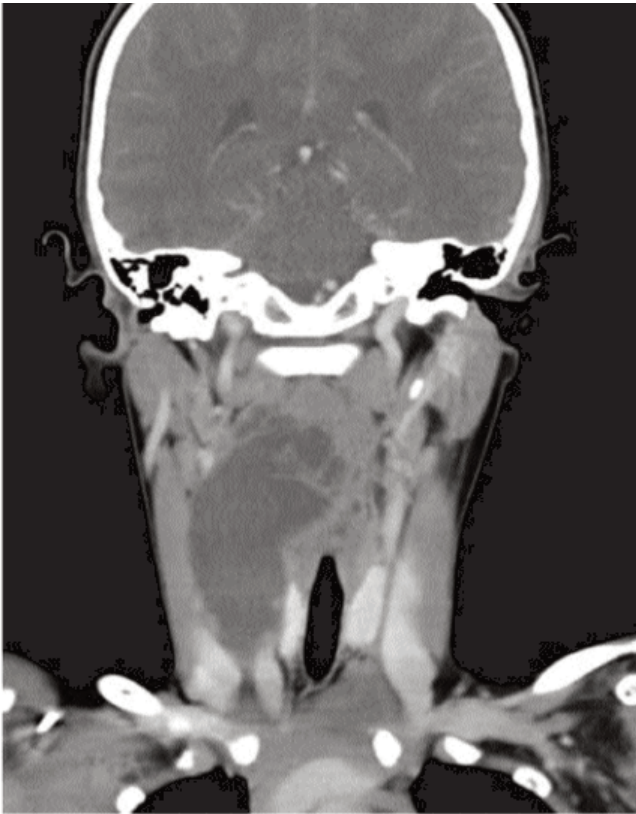
Figure-2: CT-Scan coronal cut showing the medial extent of the mass.

Complete blood count was essentially normal with the haemoglobin of 12.7g/dl (11.5-15.5g/dl), White blood count of 6.0 K/ \mu L (5.0-13.0K/ \mu L) with 46.5mm 3 neutrophils and 44.0 mm 3 lymphocytes.