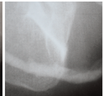
Figure-2b: Postoperative urethrogram.