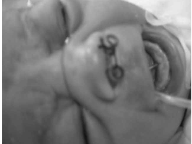
Figure-3: Photograph following successful bilateral surgical correction, showing stents in place and baby breathing at room air.