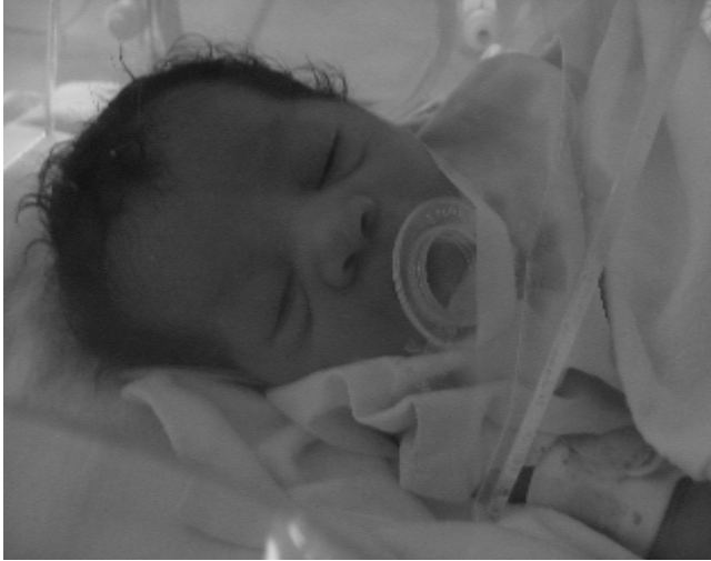
Figure-1: Photograph of baby before the surgical correction showing maintenance of patent airway by means of a pacifier with large bore hole at the end to facilitate breathing through the mouth.