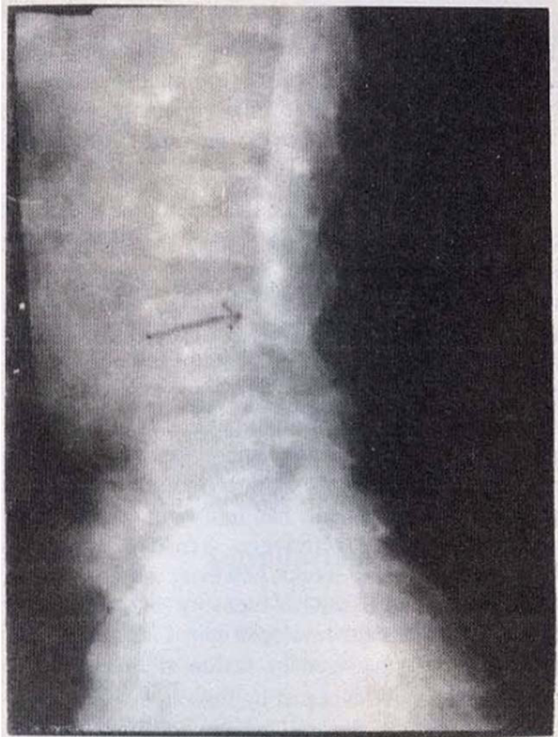
Figure 2. Lateral projection myelogram revealing L4, L5 disc prolapse with extruded disc fragment which has shifted upward to the posterolateral waist of vertebral body.