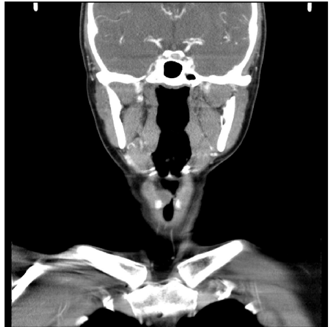
Figure-1: CT scan of the head and neck region showing a polypoidal growth protruding into the laryngeal vestibule.

A 31 year old female presented with a 5 years history of gradually developing, persistent hoarseness. She denied any history of current or previous smoking and alcohol use. Fiberoptic laryngoscopy showed both vocal cords to be mobile. However, a granulomatous growth on the right vocal cord was observed. CT scan of the head and neck showed a broad based polypoidal growth attached to the right aryepiglottic fold. (Figure-1) Tracheostomy followed by direct laryngoscopy and biopsy of the lesion were planned. Direct laryngoscopy revealed narrow glottic chink and a pedunculated smooth surfaced mass arising from the right ventricle / false cord. The tumour was debulked and submitted for histopathological examination. Deposition of amorphous pink material was seen in the underlying tissue. This material stained positive for Congo red and Sirius red stains and also demonstrated apple green birefringence on polarization. (Figure-2) Repeat fiberoptic laryngoscopy on the follow up visit showed adequate airway with fullness of the right false cord, true cord and subglottis. The patient was also investigated for signs of systemic amyloidosis. She was mildly anaemic (Haemoglobin: 10.9g/dl) with an ESR of 22