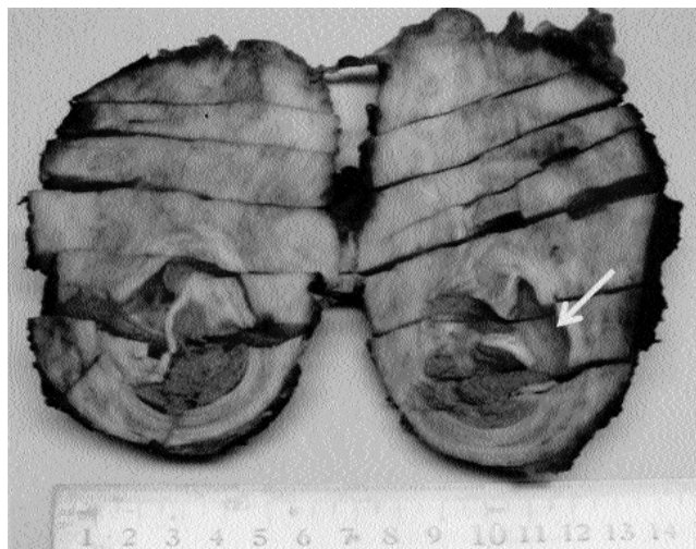
Figure 1: Section through testis and paratesticular mass demonstrating a fibrous lesion, that completely encased the testis. A cystic space compatible with a hydrocoele is present (arrow).

The specimen consisted of a right testicular mass that measured 11.5 x 7 x 4 cm, with an attached spermatic cord that measured 3.0 x 1cm. Sections revealed the testis, which measured 2.5 x 2.5 x 2.0 cm in greatest dimension, almost completely encased by a thick, firm, white fibrotic band like tissue involving the tunica albuginea and vaginalis and the epididymis but not the spermatic cord (figure 1). The testicular parenchyma was tan, soft