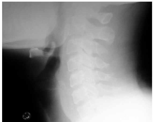
Figure-4: Lateral soft tissue radiograph of the neck after treatment shows the normal epiglottis and vallecular space.

On the 3rd day he improved with marked decrease in the swelling of the neck and the tongue. Trismus also improved. He had no respiratory problems. His voice remained muffled. At this stage examination of the oral cavity was possible. Which revealed mildly congested oropharynx. Indirect laryngoscopy showed mild congestion of the vallecula and thickened epiglottis. Vocal cords were normal. There was mild oedema of