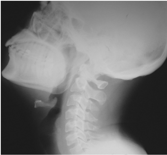
Figure-1: Lateral soft tissue radiograph of the neck shows soft tissue shadow at the base of the tongue obliterating the vallecular space and also a thickened epiglottis.

stabilization showed swelling in the right vallecula extending to the epiglottis and right ary-epiglottic fold. There was also a swelling in the right submandibular gland which enhanced on contrast CT (Fig: 2-3). A submandibular lymph node swelling was noted. On the same day after the CT, patient complained of purulent discharge from the oral cavity. On examination frank pus poured out from the right submandibular duct. The culture report of the discharge was