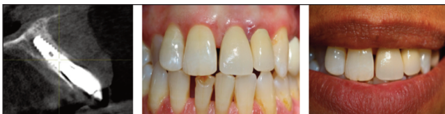
Figure-2: After a follow-up of six months, a CBCT scan showing a well-integrated implant having intact buccal cortical plate. Clinical photographs demonstrating implant prosthesis having favourable aesthetic and functional results.