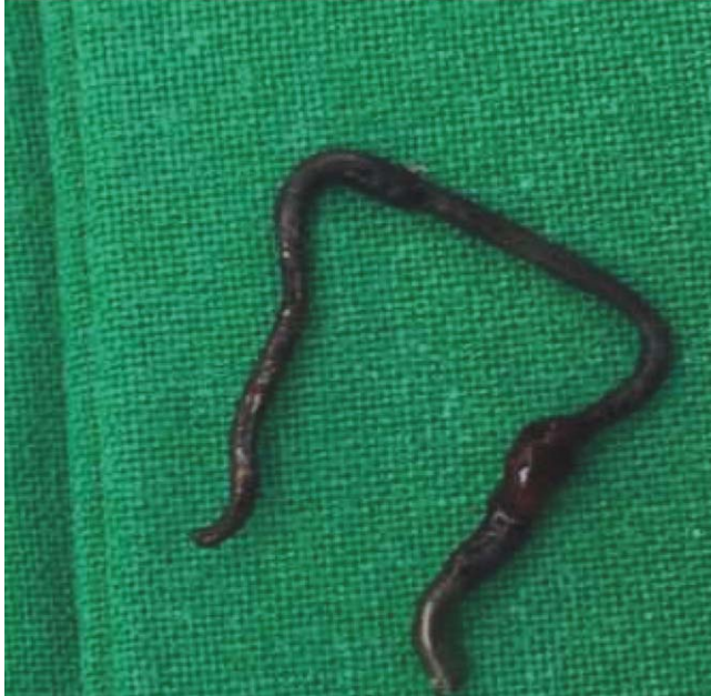
Figure-2: Metallic object extracted from the oesophagus.

attempted. The stomach was found to be filled with fresh blood. On suspicion of the presence of a hard object in upper oesophagus further study was abandoned and an immediate CXR was ordered. CXR showed a hard object lying in the oesophagus. Rigid oesophagoscopy was performed to remove the object along with flexible oesophagoscopy and to identify any bleeder. (Figures-1 & 2). Due to high risk location of the object the surgical team was taken on board to deal with any unwanted complications.