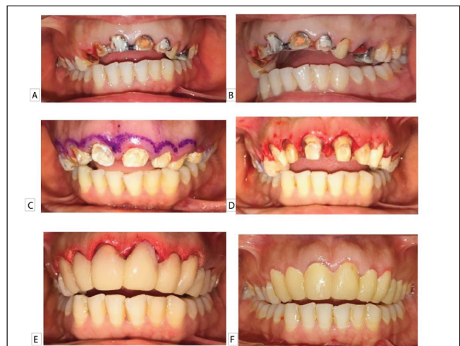
Figure-2: Crown lengthening surgery. A,B : Frontal and lateral profiles after prosthetic disassembly. C: Soft tissue marking prior to surgery, D: Post crown-lengthening, E: Temporisation after crown lengthening, F: Soft tissue healing after three months.

A: Facial frontal and lateral profile, B: Occlusion frontal and lateral profiles, C: Incisal overjet and overbite, D: Preoperative panoramic Radiograph.